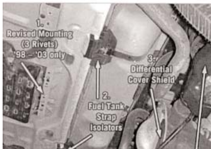
Optional Police Interceptor Package Upgrade Kit 2000 Model Year CVPI Shown - Other Model Years Similar

Sergeants are totally aware of the variety of items that can be found in a police vehicle's trunk. When the daily and weekly inspections are conducted, we as supervisors should ensure that only approved items are in the vehicle's