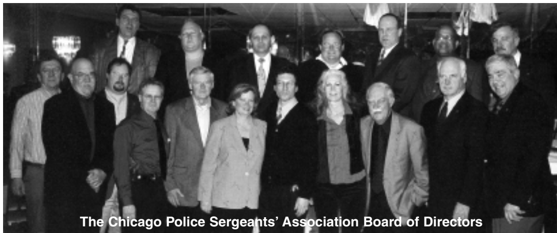
The Chicago Police Sergeants' Association Board of Directors