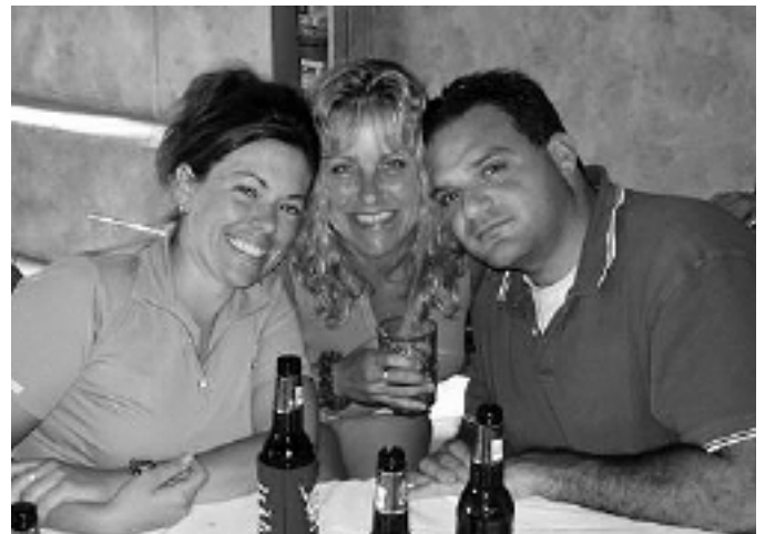
Our golfers are close