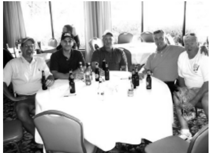
It was a great game ... right guys?