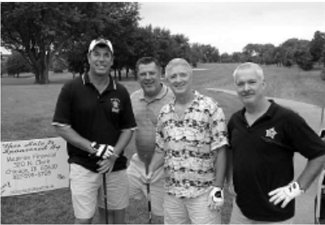
Calumet College golfers