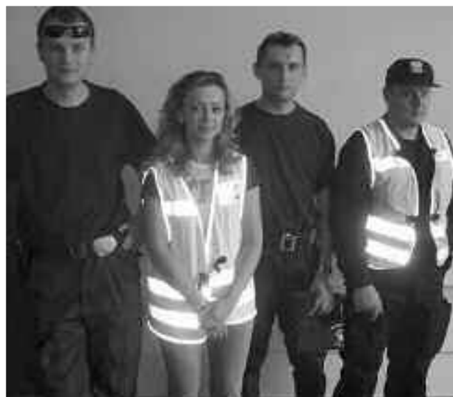
Polish Police Officers in Krakow, Poland