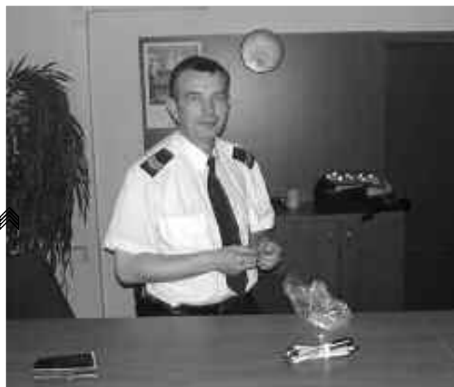
Desk Sergeant in Krakow, Poland