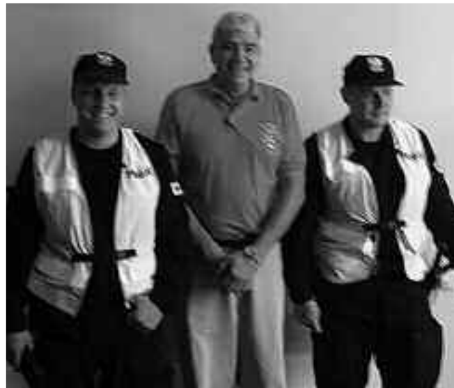
Polish P.O.s in B.D.U.s with Chevrons Editor

The annual Corned Beef Dinner honoring all the Sergeants who retired in 2007 will be held on the south side. The date is Thursday February 21st, 2008 . It will be held at the European Chalet, 5445 S. Harlem Ave. , in Chicago. There will be more information in our next issue. ⚡