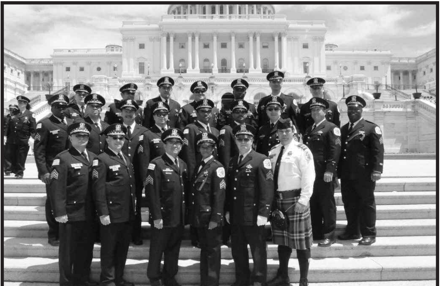
Members of the CPSA in Washington D.C. for the Police Memorial Ceremonies